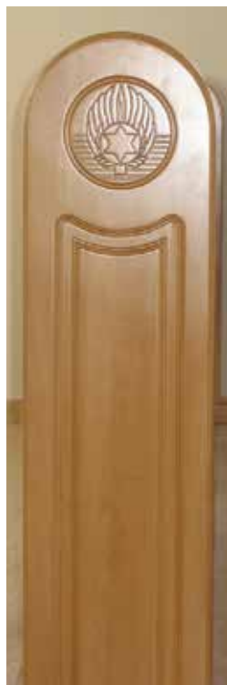
Below: The side of one of the pews at the Israeli Air Force base synagogue. The symbol is the Israeli Air Force unit tag.