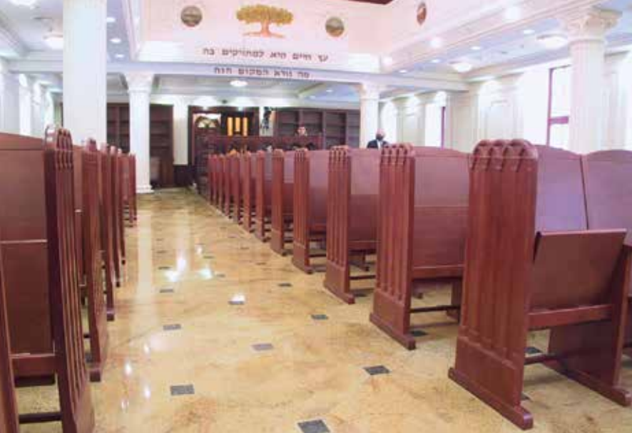
Above: Kibbutz Lavi built the pews in this synagogue in Kiev, Ukraine, in 2002.