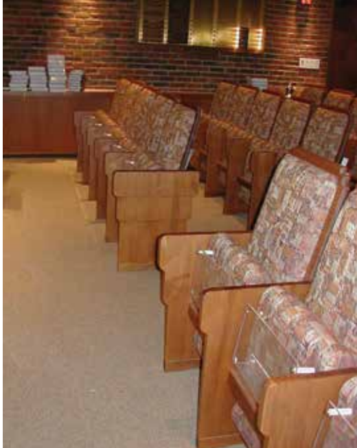
Temple Reyim in Newton, Mass. Kibbutz Lavi built the seats in the sanctuary in 1998 and in the beit midrash, a room for study, in 2003.

"When we did our strategic analysis, I said that we must, must, must look for other products, other venues. We can't totally rely on houses of worship. [But] if Muslims were to sit instead of stand when they pray, we might be able to do some business!" ☺